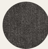
SLATE GREY BOUCLÉ FABRIC