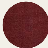
MERLOT BOUCLÉ FABRIC