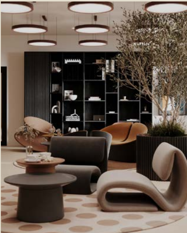
DUBNA LOUNGE CHAIRS Project by Studio Okooko