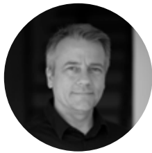
Designed by Jacob Amtorp

With a touch of futuristic elegance the BUCKLE chair offers a playful design. Its formpressed wooden 'wave' in the back supports a molded foam backrest which brings a light and airy feel. The solid wood legs complete the look of a beautifully crafted design that truly stands out.