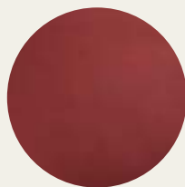
MERLOT FAUX LEATHER