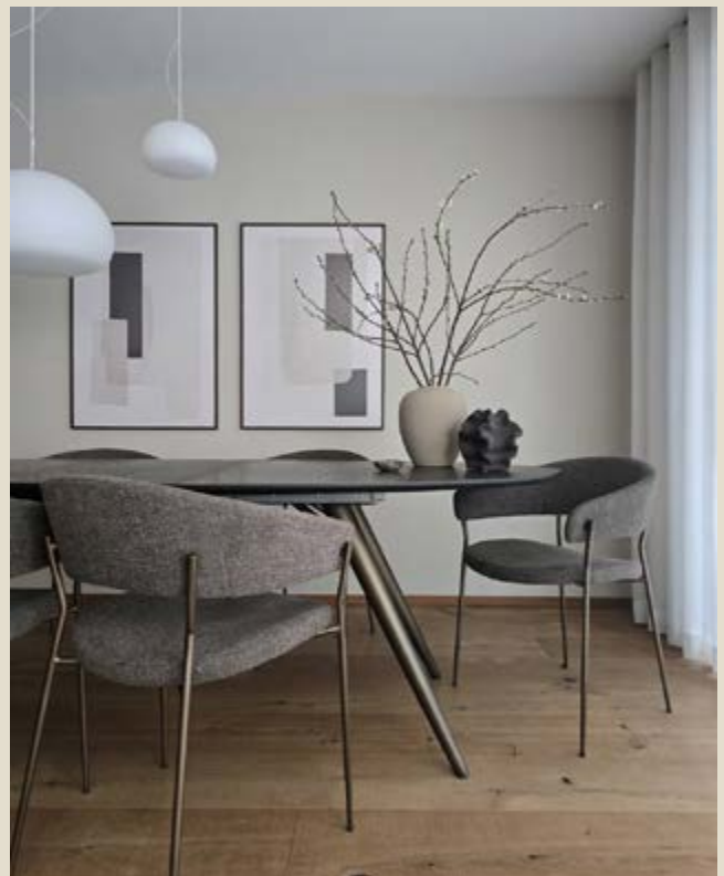
REBOOT CHAIRS Interior design by Nedas Home