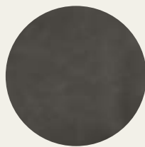
SLATE GREY FAUX LEATHER

In addition we see shades of grey being used to bring the tranquility of nature indoors. Vibrant and deep reds are gaining popularity as statement colours. These earth tones add richness and sophistication without overwhelming the space. Our new colours will be available in faux leather and bouclé.